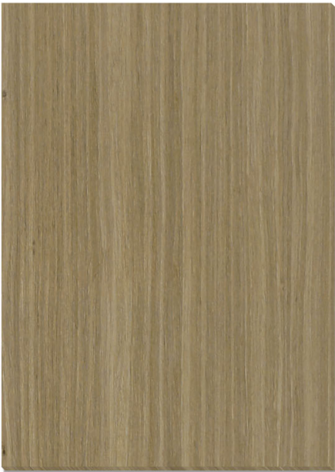
▶ K6309AB Dyed Oak-W.B. 3.3mm (10' Available)