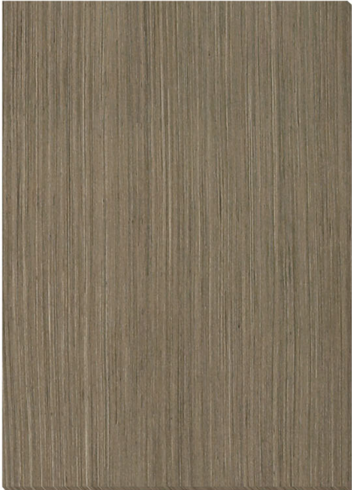
▶ K6343 Slate 3mm (10' Available)