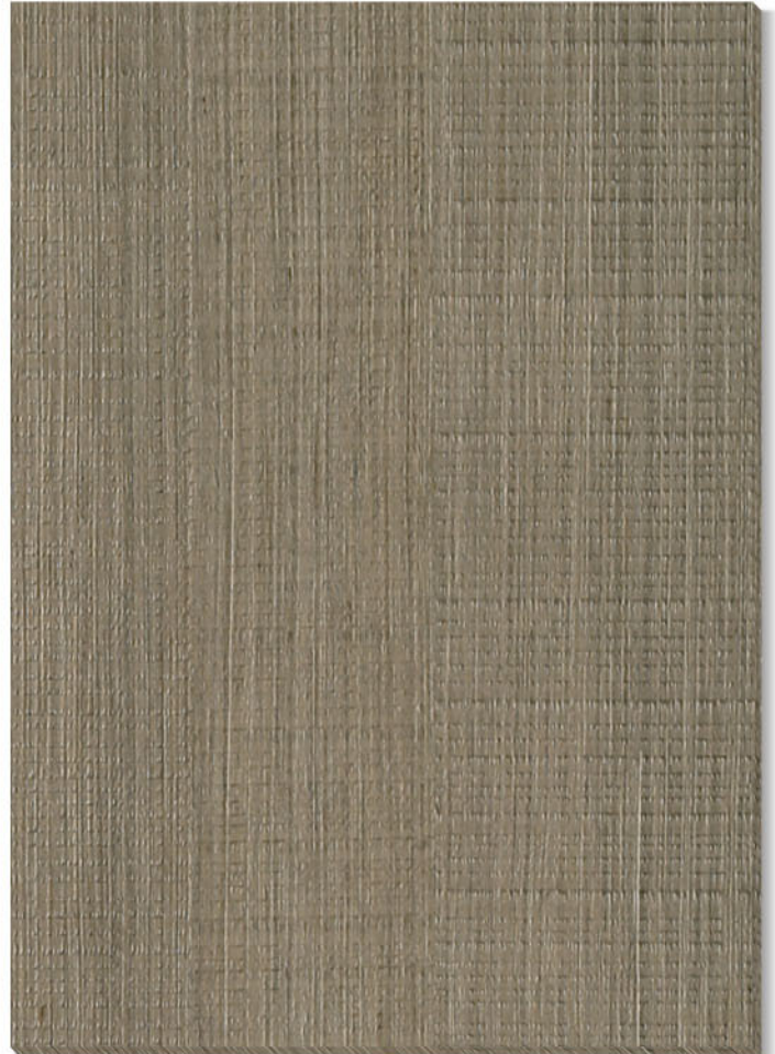
▶ K6343AR Slate(Rough-cut) 3.3mm