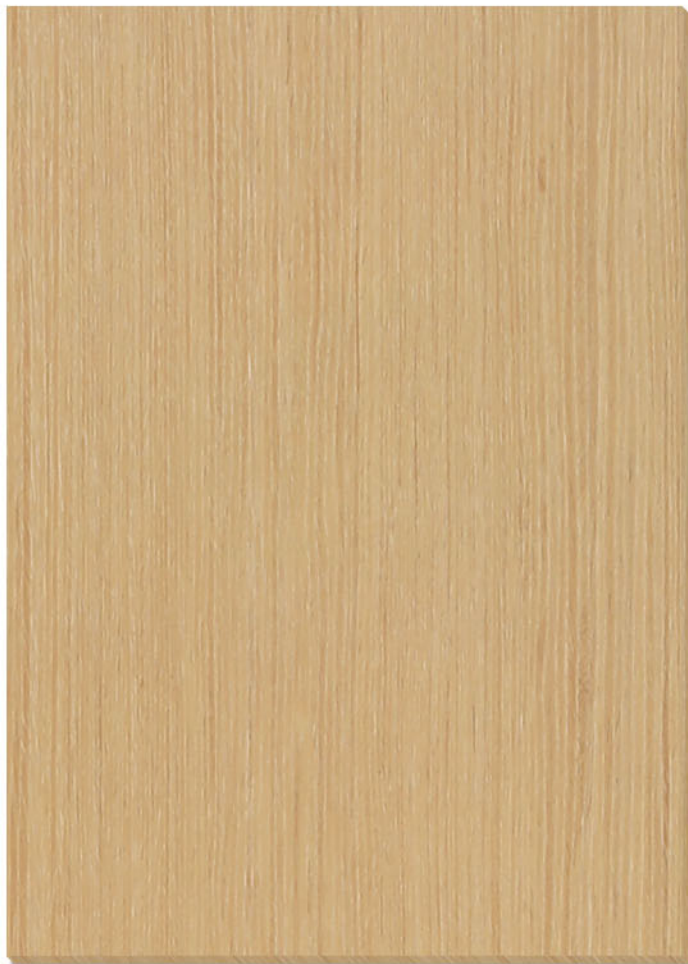
▶ K6306 White Oak 3mm