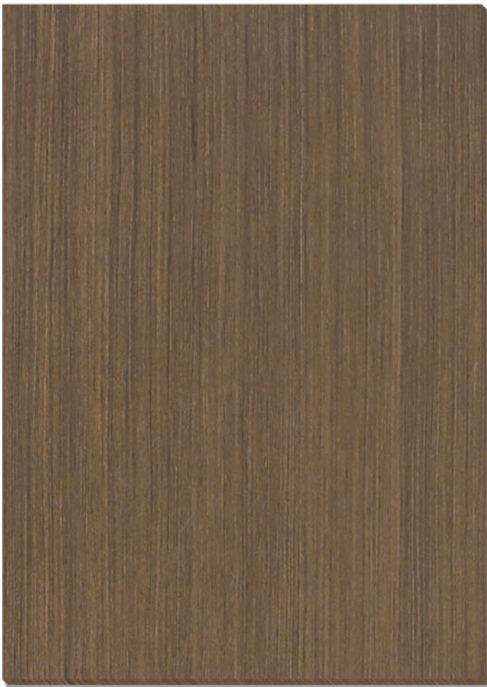
▶ K6353 Poplar 3mm