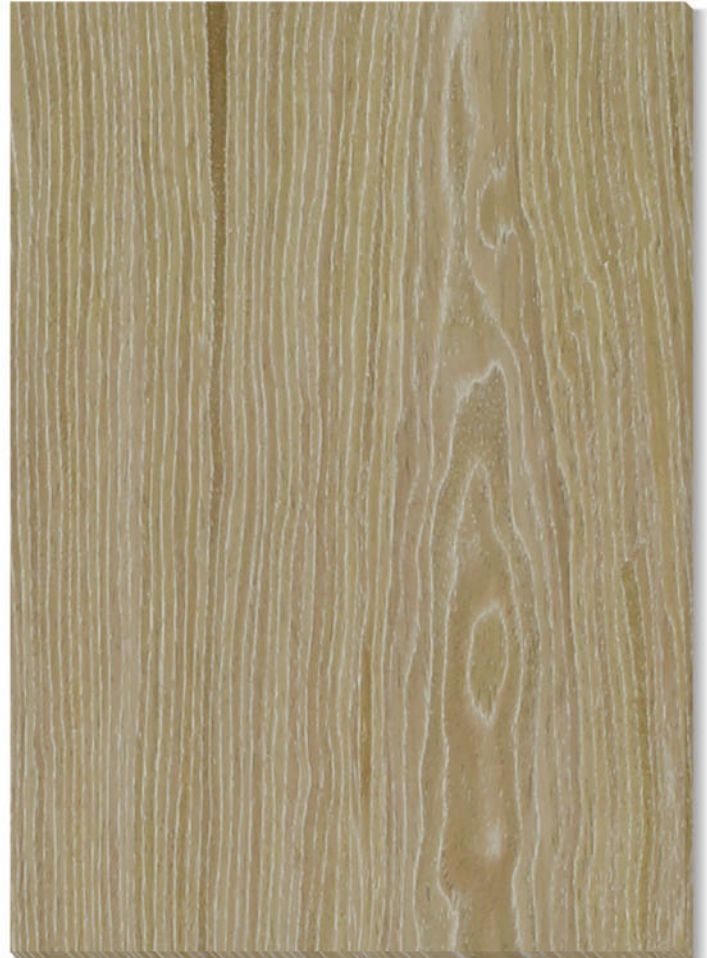
▶ K6235M Dyed Oak-C.C. 3mm

KD Panels use top-grade Malaysian F1-Plywood to achieve the lowest formaldehyde emissions in the market.