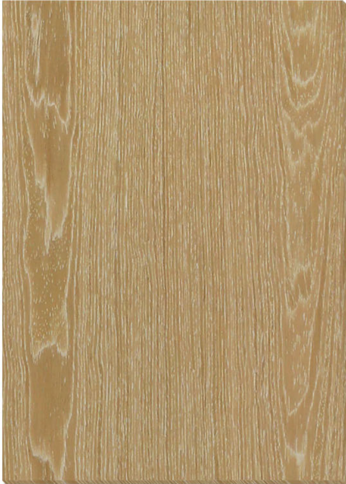
▶ K6234M White Oak-C.C. 3mm