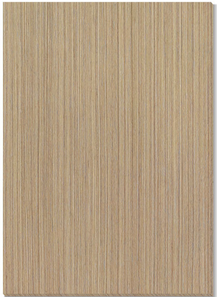
▶ K6342AB Silver Silk-W.B. 3.3mm (10' Available)