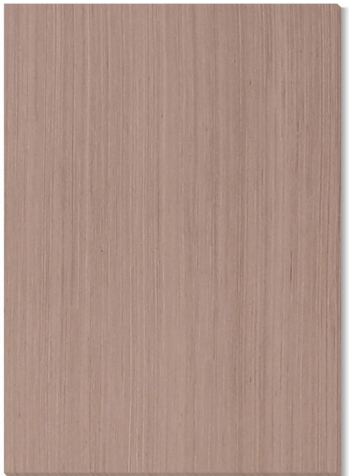
▶ K6307 Poplar 3mm