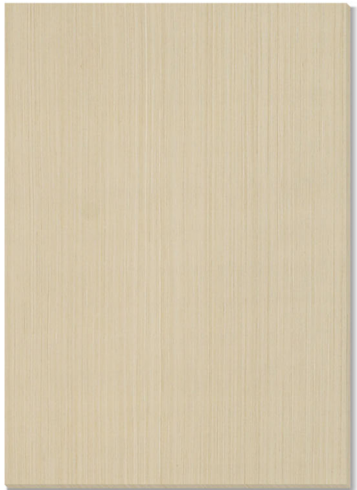
▶ K6331 Poplar 3mm