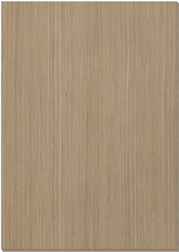
▶ K6342 Silver Silk 3mm