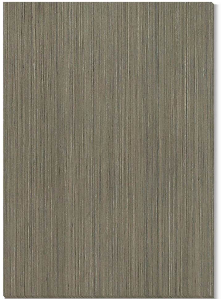
▶ K6358 Poplar 3mm