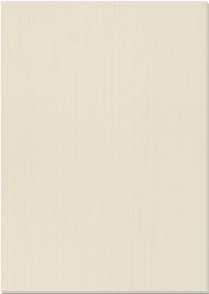
▶ K6227 White Oak 3mm