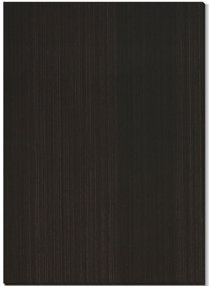
▶ K6262 Ebony 3mm