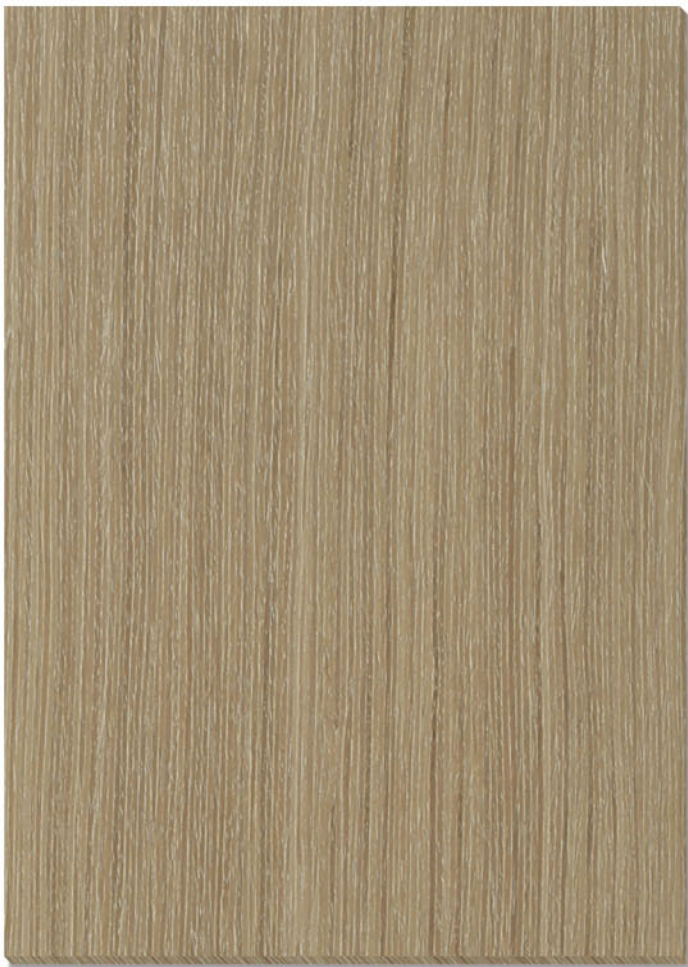
▶ K6236 Dyed Oak 3mm