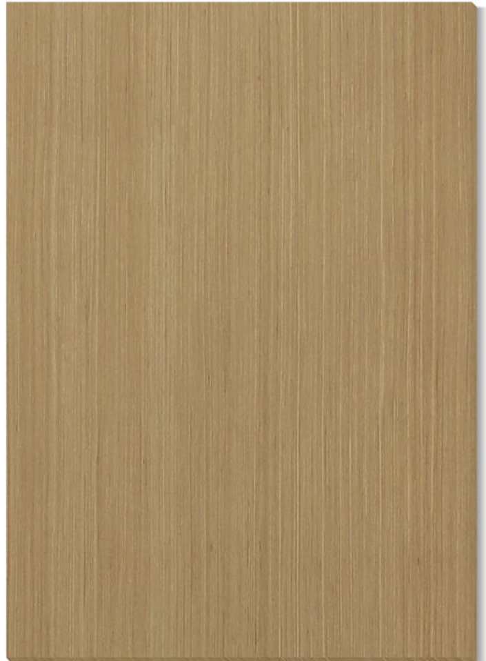
▶ K6334 Poplar 3mm (10' Available)

KD Panels use top-grade Malaysian F1-Plywood to achieve the lowest formaldehyde emissions in the market.