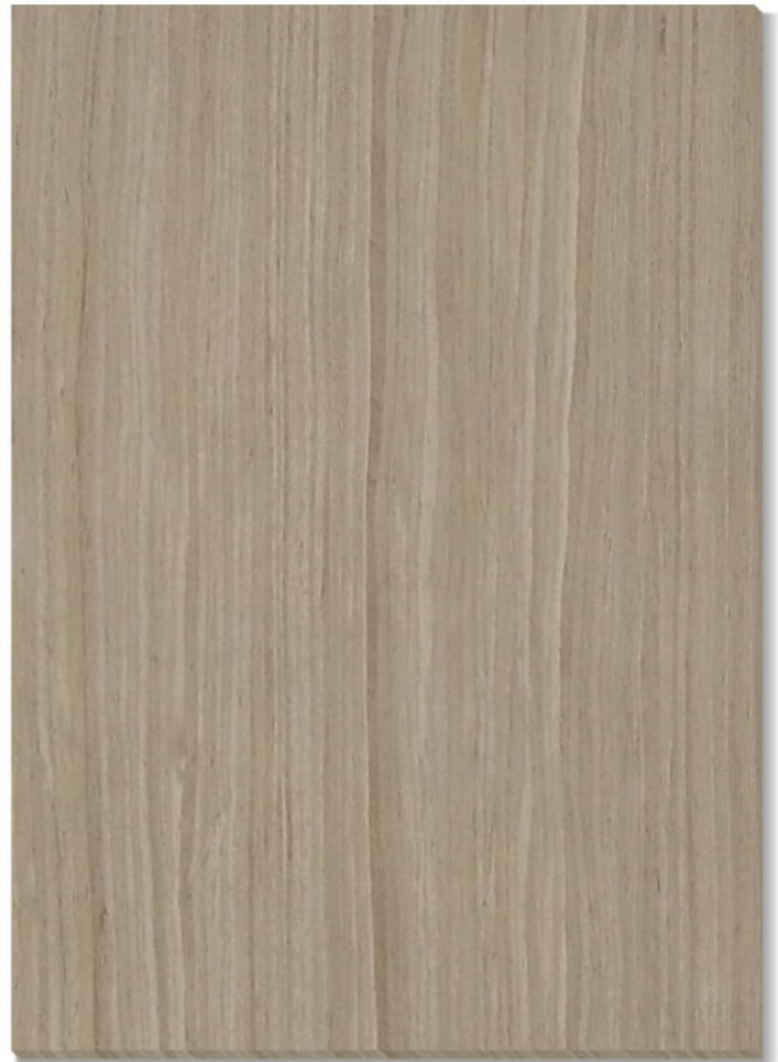
▶ K6229 Ash 3mm